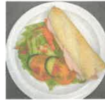
Ham Sandwich Or 1/2 Baguette