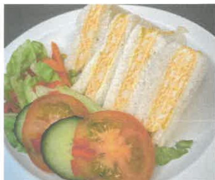
Egg Mayo Sandwich