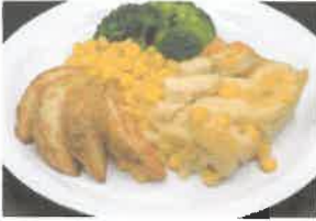
Chicken & Sweetcorn Pasta Bake, served with Seasonal Vegetables