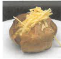
Jacket Potato served with a choice of Tuna Mayo / Cheese or Beans