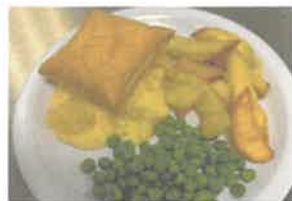
Cheese & Potato Pie With Baked Beans