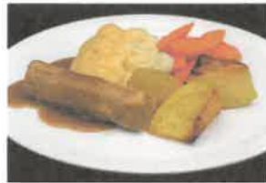
Vegetarian Sausage served with Wedges & Seasonal Vegetables