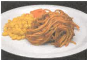
Beef Pasta Bolognese, served with Seasonal Vegetables