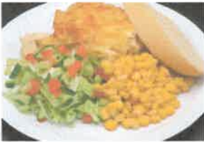
Chicken Pasta with Cheese Sauce & Seasonal Vegetables