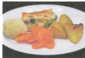
Cauliflower Broccoli Cheese Bake with Roast Potatoes and Seasonal Vegetables