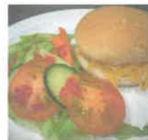
Cheese Sandwich Or Bap