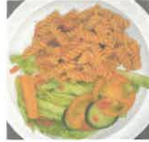
Tomato & Basil Pasta