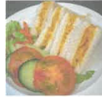
Cheese Sandwich Or Wrap