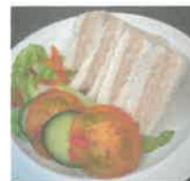
Tuna Mayo Sandwich Or Bap