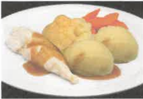
Roast Chicken, Mashed Potatoes & Gravy served with Seasonal Vegetables