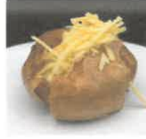
Jacket Potato served with a choice of Tuna Mayo / Cheese or Beans