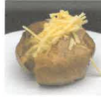
Jacket Potato served with a choice of Cheese, Beans or Tuna Mayo