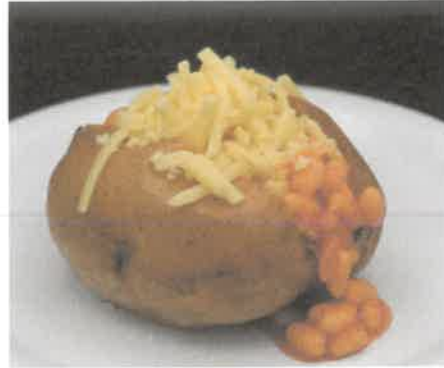
Jacket Potato with Grated Cheddar Cheese & Beans