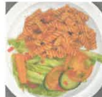
Tomato & Basil Pasta