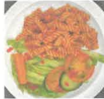
Tomato & Basil Pasta