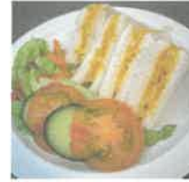
Cheese Sandwich Or Bap