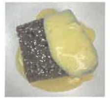
Chocolate Sponge and Custard