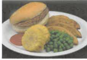
Vegetable Falafel Burger in a Bun served with Wedges & Seasonal Vegetables