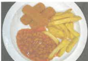
Fish Fingers, served with Chips, Garden Peas or Baked Beans