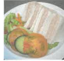
Tuna Mayo Sandwich Or Bap