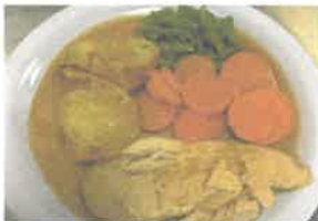
Roast Turkey, served with Roast Potatoes, Gravy and Seasonal Vegetables