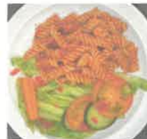
Tomato & Basil Pasta