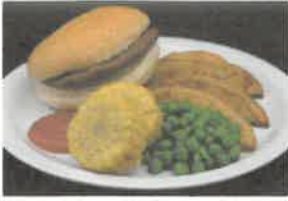
Beef Burger in a Bun with Wedges & Seasonal Vegetables