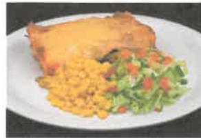
Vegetarian Lasagne, with Warm Baguette & Salad