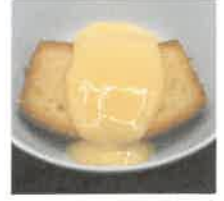
Lemon Sponge and Custard