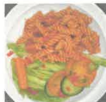
Tomato & Basil Pasta