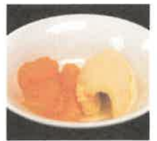
Vanilla Ice Cream & Peaches