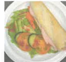
Ham Sandwich Or 1/2 Baguette