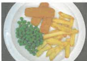
Fish Fingers, served with Chips, Garden Peas or Baked Beans