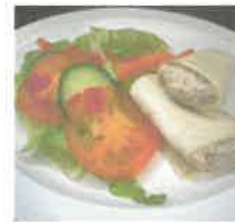
Tuna Mayo Wrap Or Sandwich