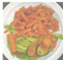
Tomato & Basil Pasta