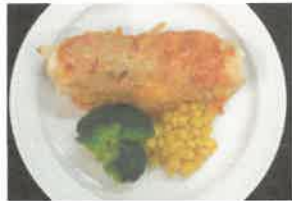
Bean Enchilada served with Savoury Rice & Seasonal Vegetables