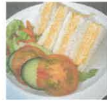
Egg Sandwich Or 1/2 Baguette