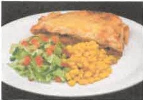
Beef Lasagne, served with Warm Baguette & Salad