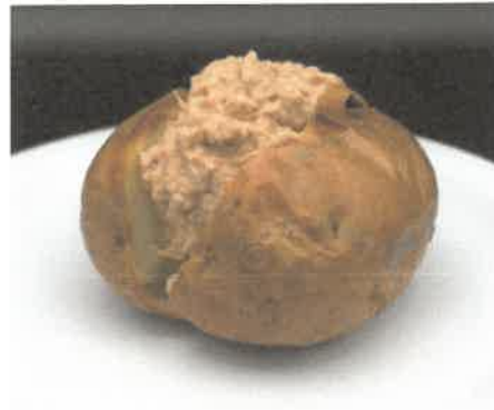
Jacket Potato with Tuna Mayonnaise