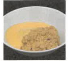
Mixed Fruit Crumble & Custard