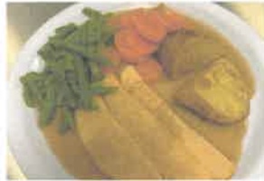
Roast Quorn Fillet, served with Roast Potatoes, Carrots and Green Beans