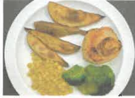
Cheese & Tomato Pinwheel & Diced Potatoes