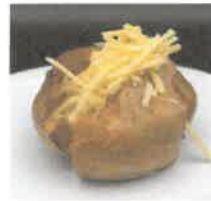
Jacket Potato served with a choice of Cheese, Beans or Tuna Mayo