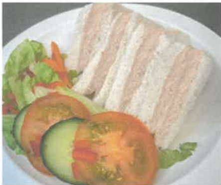
Tuna Mayo Sandwich