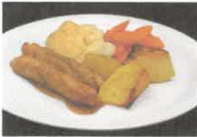
Pork Sausages with Wedges & Gravy, served with Seasonal Vegetables