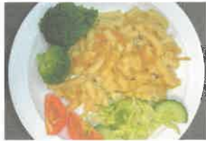
Macaroni Cheese, served with Sweetcorn and Mixed Green Salad