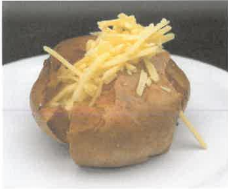
Jacket Potato with Grated Cheddar Cheese

All of our Jacket Potato options are offered on alternate days; What will you choose to fill your Jacket Potato with? Cheddar Cheese, Beans, Cheddar Cheese & Beans or Tuna Mayonnaise.