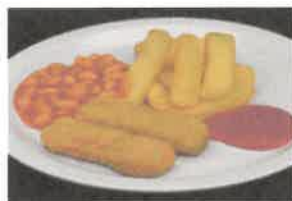
Vegetable Fingers served with Chips and Seasonal Vegetables