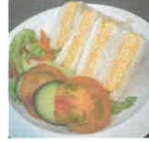
Egg Mayo Sandwich Or 1/2 Baguette